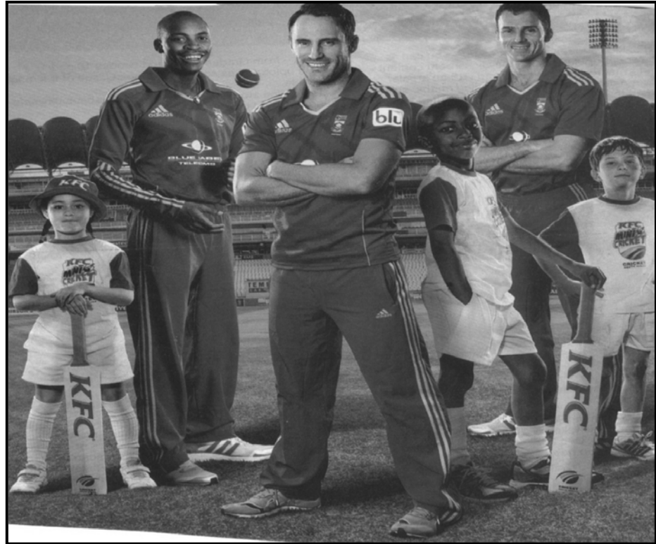
[Sicashunwe ku-Drum Magazine-Okthoba2013]