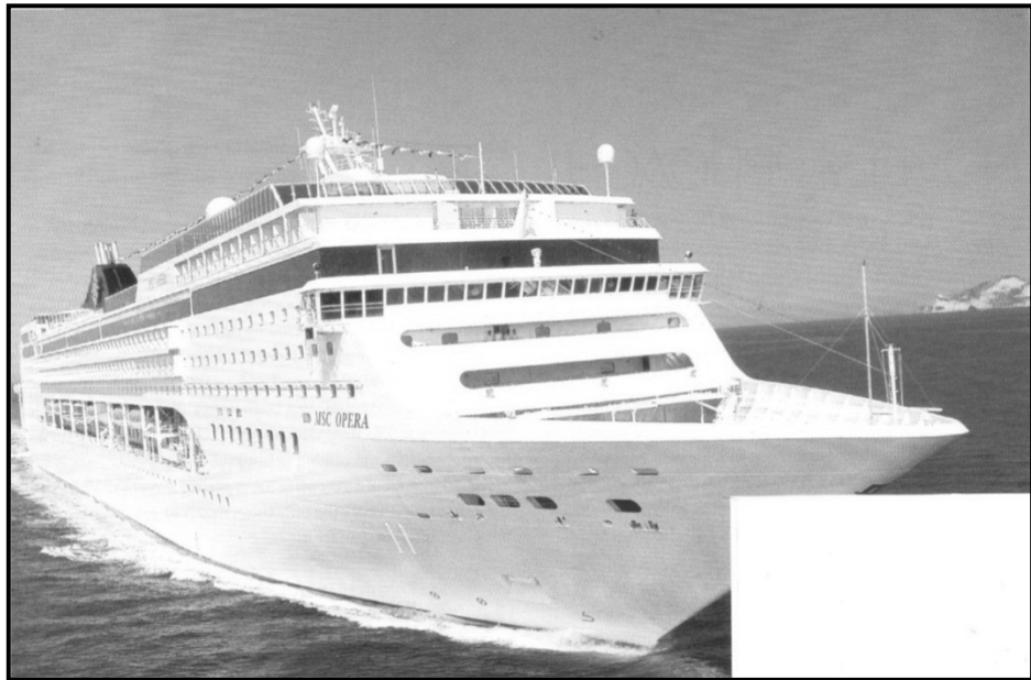
[Sicashunwe ku-Destiny Magazine-2013]