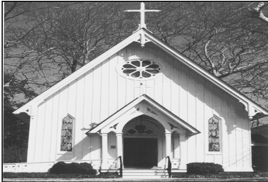
[Sicashunwe ku- www.googlepictures.com ]