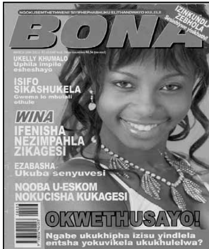
[Sicashunwe ku-Bona Magazine-2008]