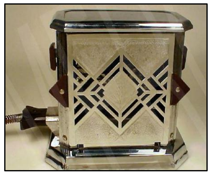
FIGURE I: Fostoria Toaster manufactured by Bersted MFG Co (Art Deco) (USA), 1930s.

Write an essay (at least ONE page) in which you compare the toaster in FIGURE H with the toaster in FIGURE I above. Explain how these toasters are typical of the movements they fall under.