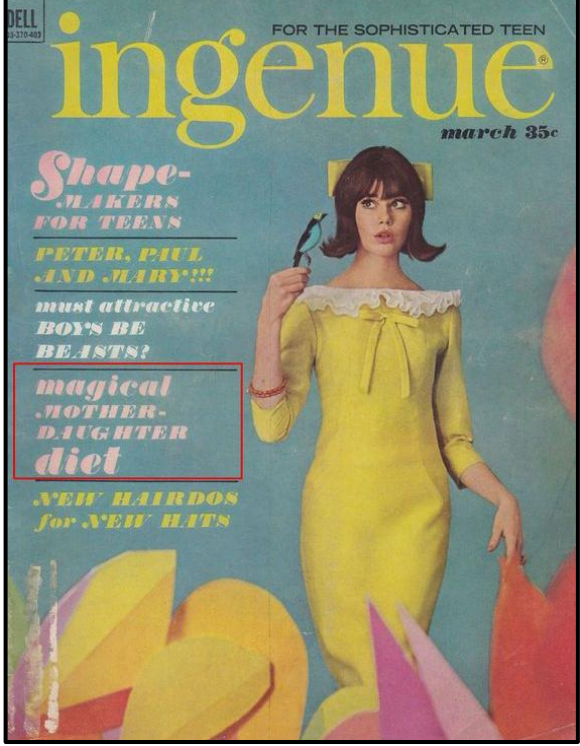
FIGURE D: Ingenue Magazine Cover by Dell Publishing Company (London), 1964.