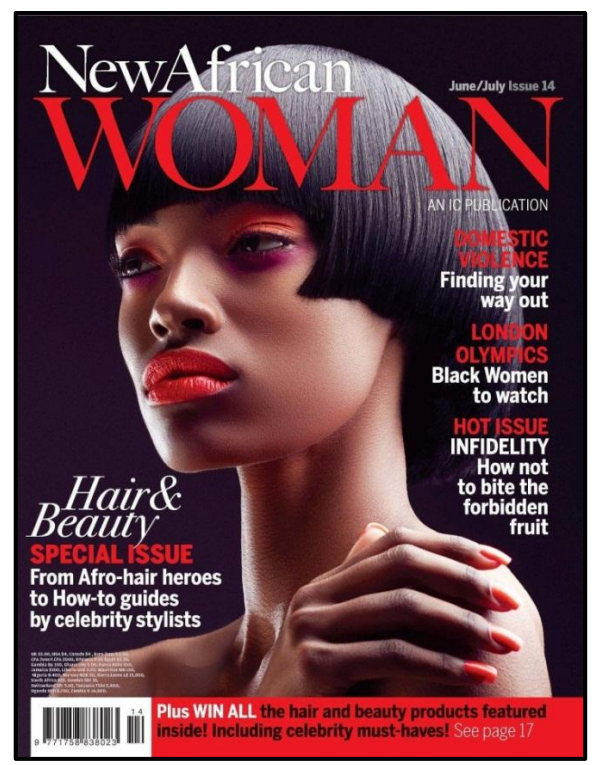
FIGURE E: New African Women Magazine Cover by IC Publications (London), 2014.

Compare the magazine cover in FIGURE D with the magazine cover in FIGURE E.