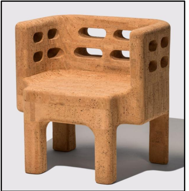
FIGURE L: Chair from the Sobreiro Collection by the Campana Brothers (Brazil), 2018. The chair is made of cork.

(Cork is a material that is derived from the bark of a cork oak tree. The bark is stripped from the tree, which is never cut down, to harvest the cork. Cork is environmentally friendly, waterproof and buoyant.)