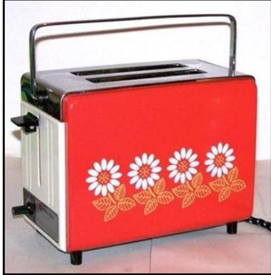
FIGURE H: Toshiba Toaster (Pop design) (Japan), 1960s.