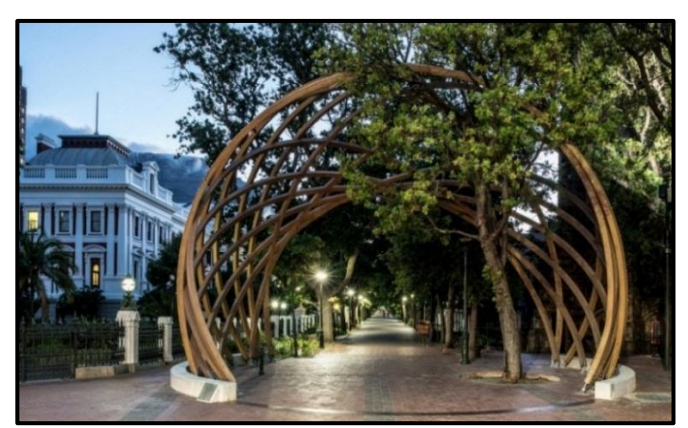
FIGURE G: #ArchForArch Commemorative Arch for Archbishop Desmond Tutu (South Africa), 2017.

FIGURE F: The Arch of Caracalla , an ancient Roman city of Volubilis, commissioned by governor Marcus Aurelius Sebastenus (Morocco), 217 ACE.