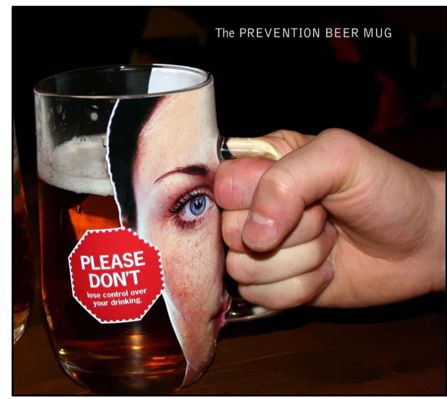
FIGURE J: Prevention Beer Mug Poster by EURORSCG Advertising Agency (Czech Republic), 2008.

5.1.1 Discuss how the message of the poster campaign in FIGURE J above is communicated by referring to the designer's use of layout and symbolism.