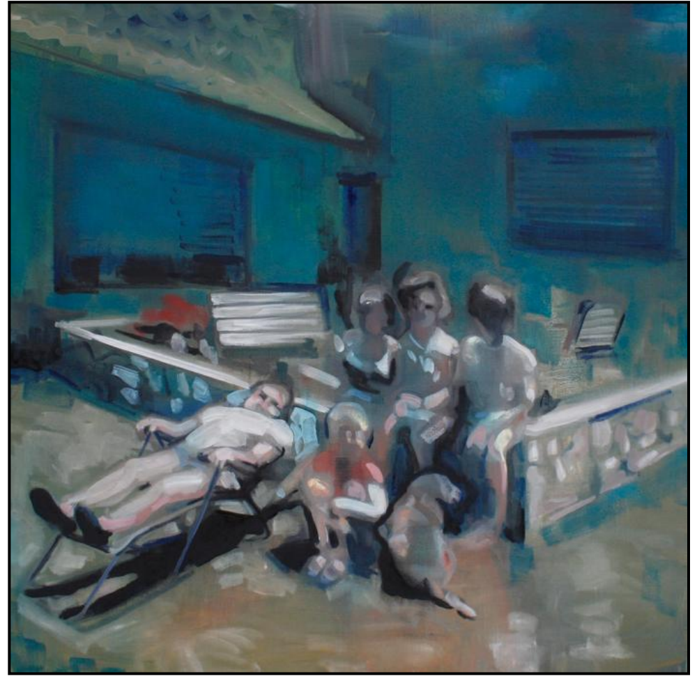
FIGURE 20: Kate Gottgens, Family Fragments, oil on canvas, 2013.