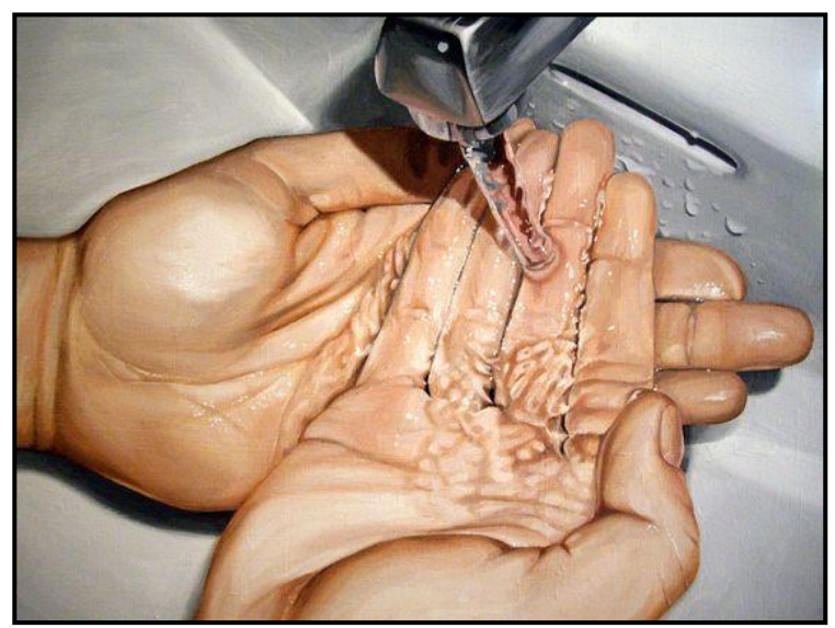
FIGURE 10: Linnea Strid, Daily Routines , oil on plywood, 2010.