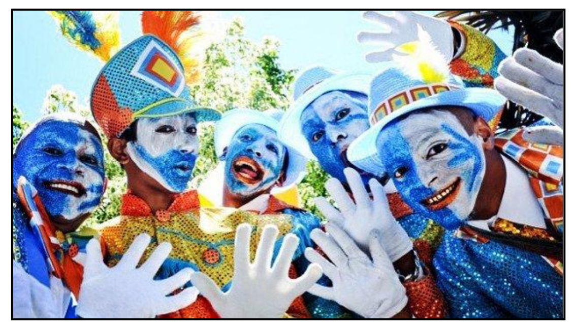
FIGURE 8: A ritual can also relate to cultural activities or traditions that happen in everyday life. The Kaapse Klopse or Cape Minstrel Carnival comes alive to celebrate the new year. Other carnivals include the Mardi Gras in New Orleans and the Carnival in Rio de Janeiro.