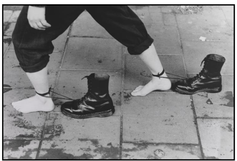
FIGURE 23: Mona Hatoum, Performance Still Photograph , 1985. Artists' performances often have a ritualistic quality. Artists create and use their own personal mythologies in order to explore their identity. Mona Hatoum explores the fragility of the human condition under threat. Hatoum walked barefoot through the streets of London for nearly an hour with Doc Marten boots, usually worn by the police, attached to her ankles by their laces. This act, captured in the Performance Still Photograph in 1985, reminds us of religious pilgrimages where pilgrims endure extreme hardship to show their belief and faith.