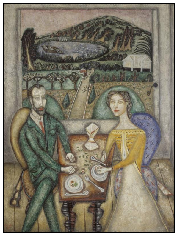
FIGURE 15: Cecil Collins, The Artist and His Wife , oil on canvas, 1939. The painting depicts the ritual of daily afternoon tea with the couple sitting opposite each other like high priests.