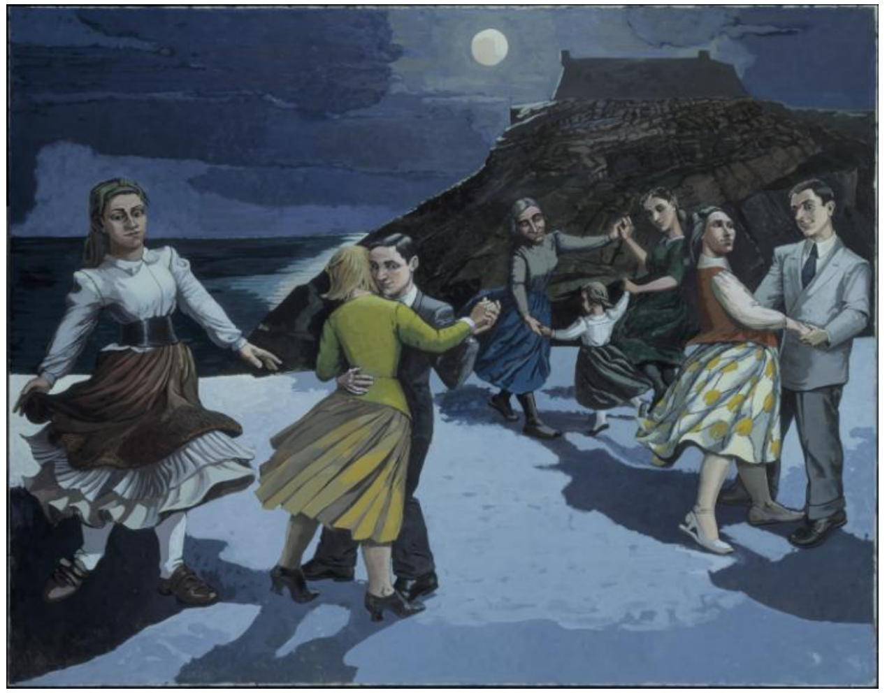
FIGURE 13: Paula Rego, The Dance , acrylic paint on canvas, 1988.