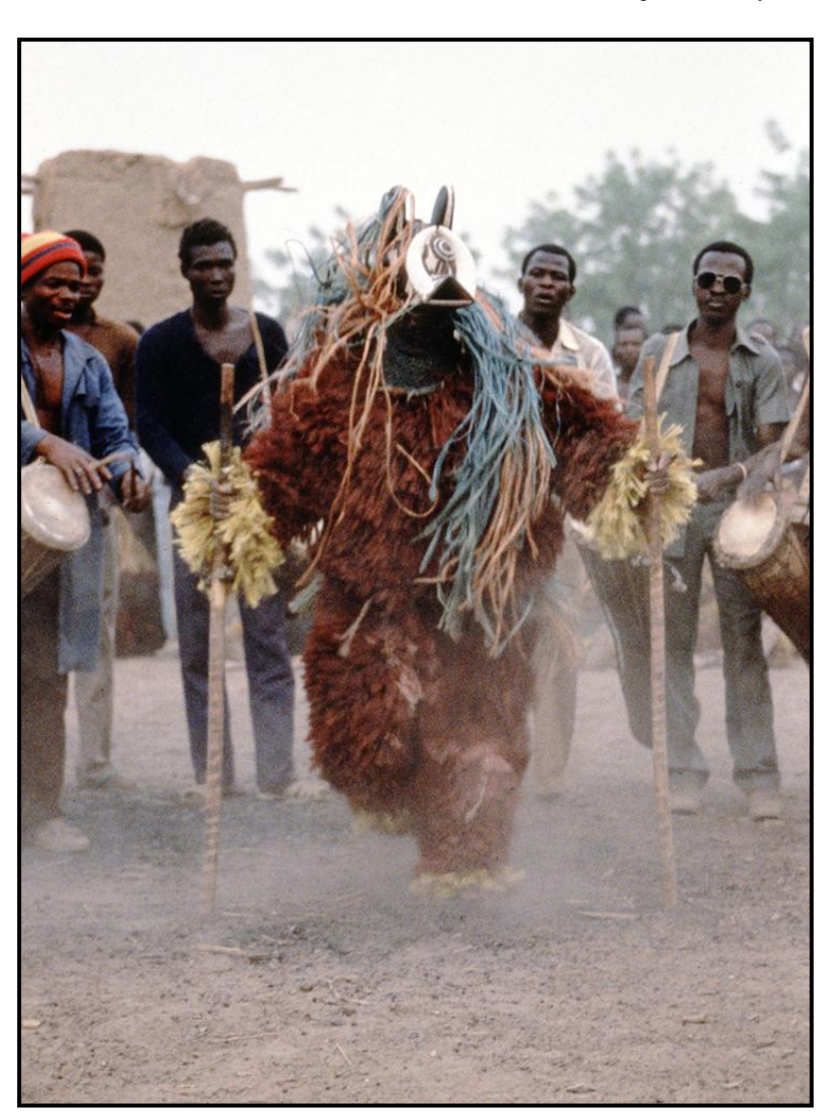
FIGURE 22: The Nuna peoples doing the Bush Pig Mask Performance in the village of Tierko, Burkina Faso, 1985. The Nuna peoples perform an annual renewal celebration to purify the community of negative, antisocial or dangerous forces. During these rites masked dancers appear from the wilderness that surrounds the village and fields. During the performance drummers play songs that are unique to each masquerade. The bush pig mask from the Nuna village dances and tosses its head, copying the character of the animal.