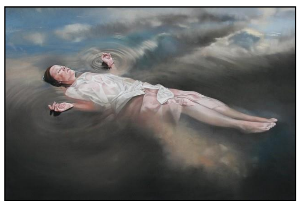
FIGURE 21: Hanneke Benade, Skyedive , pastel on cotton paper, 2008.