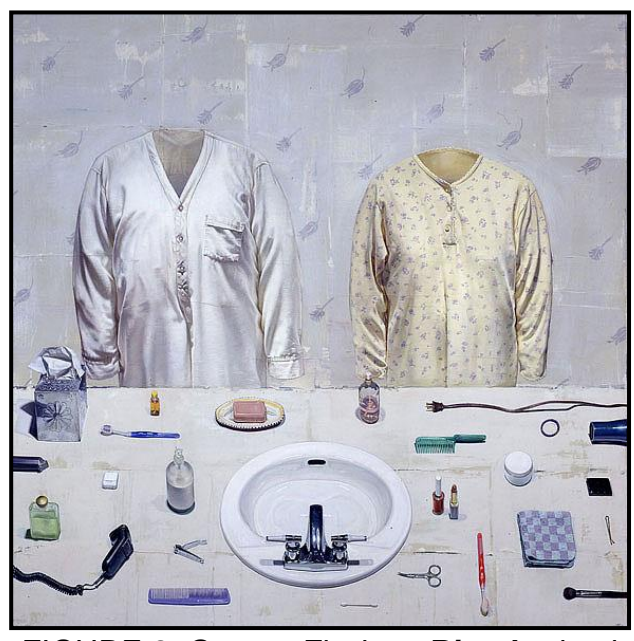
FIGURE 2: George Fischer, Ritual , mixed media on wood panels, date unknown.