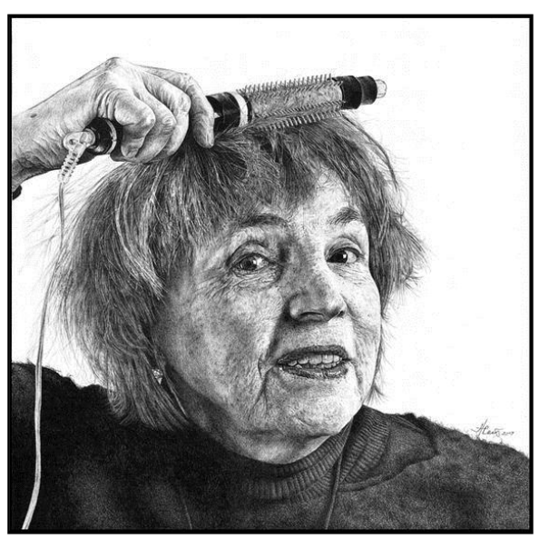
FIGURE 4: Heikki Leis creates hyper-realistic drawings of morning rituals from the series Everyday Reflection , graphite pencil, 2007–2009.