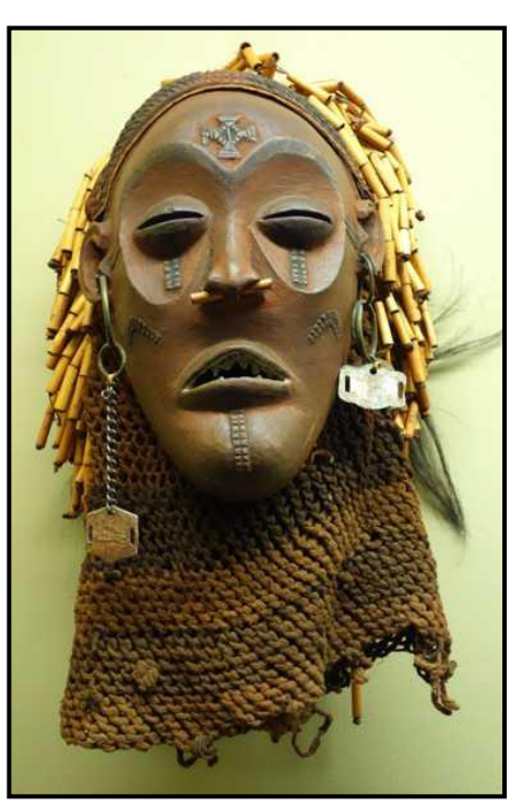
FIGURE 7: Chokwe, Dance Mask , Royal Museum Central Africa, clay, beads and found objects, 17<sup>th</sup> to 19<sup>th</sup> century.