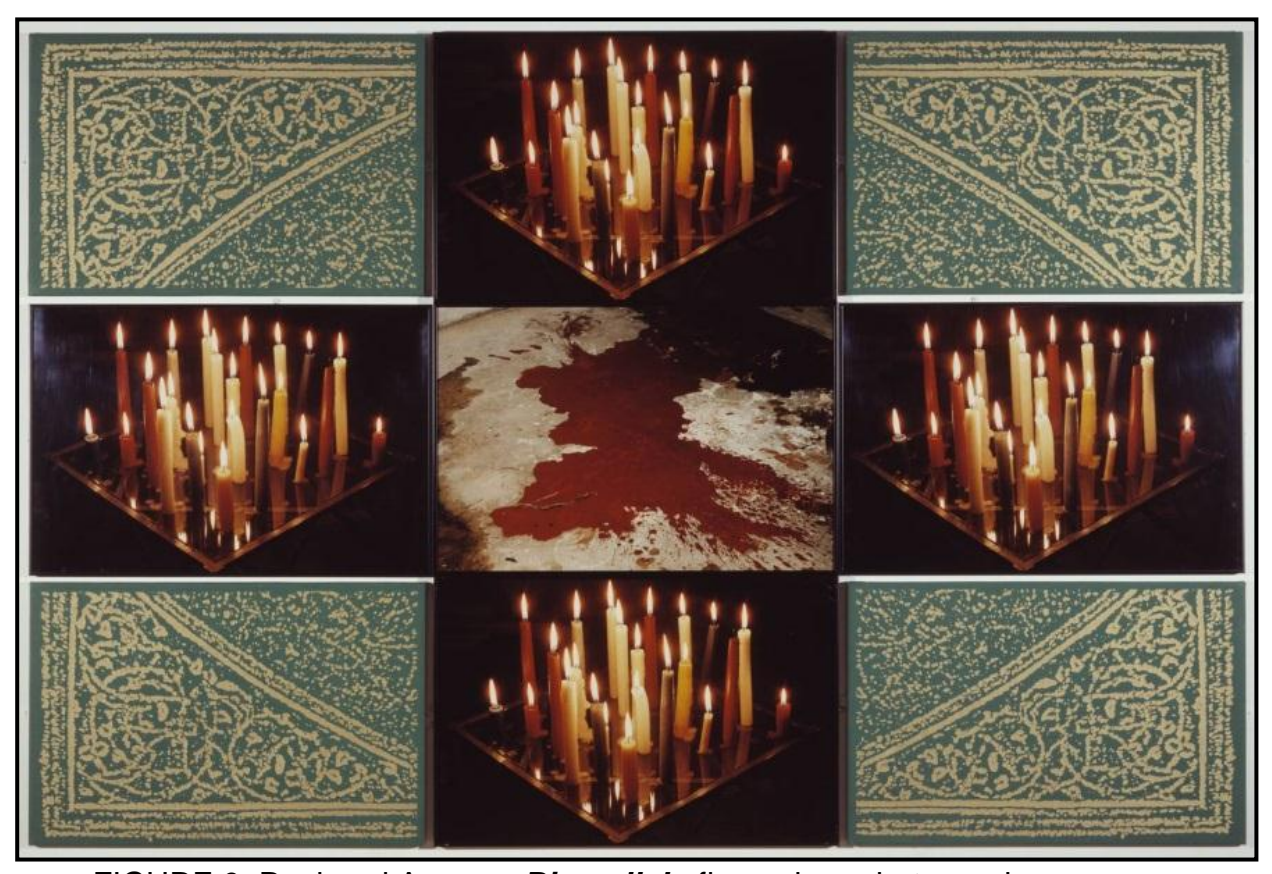
FIGURE 9: Rasheed Araeen, Bismullah , five-colour photographs on paper, acrylic and gold paint on canvases, 1988. Artists often reference rituals through objects, as seen in Araeen's Bismullah . Araeen explores his identity as a Muslim in British society through photographs referencing Islamic rituals.

The word 'ritual' is often connected with cultural and religious ceremonies, like graduations, baptism/christenings or processions. They include worship rites, rites of passage and purification rites. As children mature a special puberty rite of passage, initiation, is meant to help them move smoothly from childhood into adulthood. Through initiation, young adults learn about the traditions and customs of their community. Rites of passage are important in nation-building and identity formation.