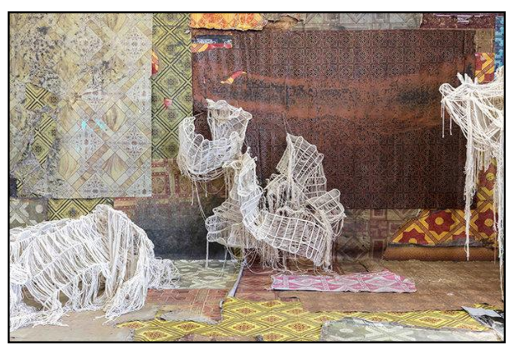
FIGURE 17: Igshaan Adams, Crawl , garden fencing and cotton twine, 2018. The artist creates a multisensory large-scale installation, bringing together aspects of textiles, sculpture, found objects and performance.