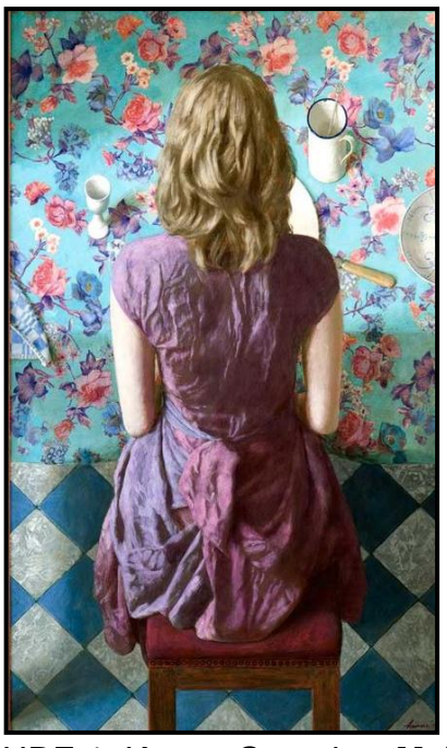
FIGURE 1: Kenne Gregoire, Meisje aan Tafel (Girl at the Table) , acrylic on panel, 2011.

What are your daily rituals and habits? Going to school, brushing your teeth, going for a walk, yoga, meditation, reading, gelling or braiding your hair, applying make-up, checking your inbox and meeting your friends at the skatepark. What are your family's rituals: going to a soccer match, playing Xbox, having Sunday lunch or a picnic in the park?