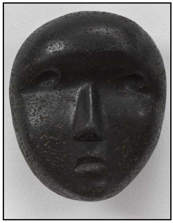
FIGURE 6: Henry Moore, Mask , cast cement, 1929.

Masks are often associated with rituals. African masks are seen as part of a ceremonial costume. They are used in religious and social events to represent the spirits of ancestors or to control the good and evil forces in the community. Some combine human and animal features to unite man with his natural environment.