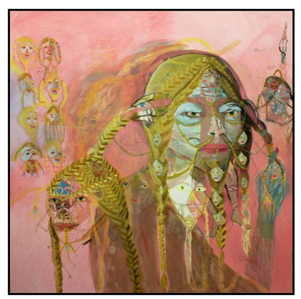
FIGURE 3: Marlene Steyn, Braided Bonding , oil and mixed media on canvas, 2013.