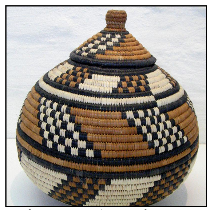
FIGURE 4a: The African Art Centre, Ilala Palm Baskets, palm, grass and dye (produced to store Zulu beer), date unknown.