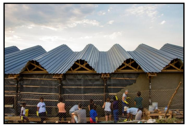
FIGURE 8b: Collectif Saga, building process of Silindokuhle Preschool .