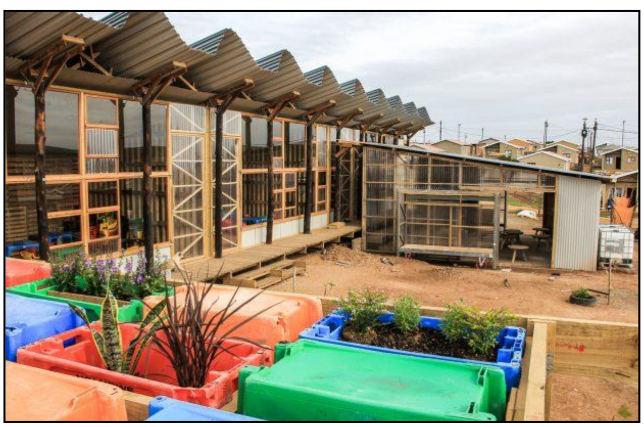
FIGURE 8a: Collectif Saga, Silindokuhle Preschool, Port Elizabeth, South Africa, 2018.