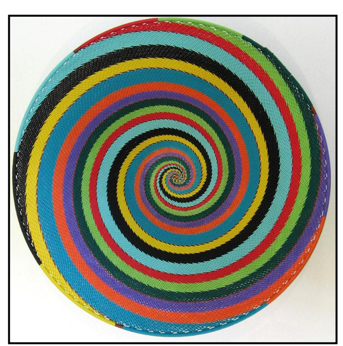
FIGURE 4c: The African Art Centre, Telephone-wire basketry, wire. This craft is said to have originated in the 1950s in KwaZulu-Natal.