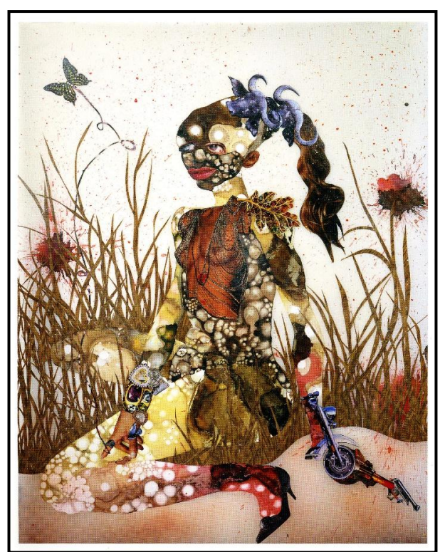
FIGURE 2b: Wangechi Mutu, In Killing Fields Sweet Butterfly Ascends , ink, collage, paper, 2003.