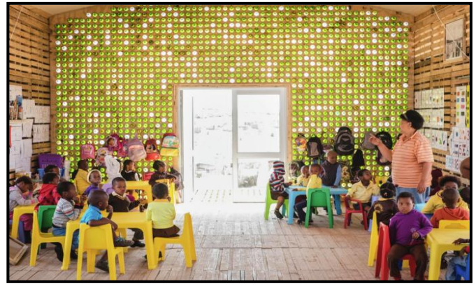
FIGURE 8c: Collectif Saga, a view of the interior of the classroom.