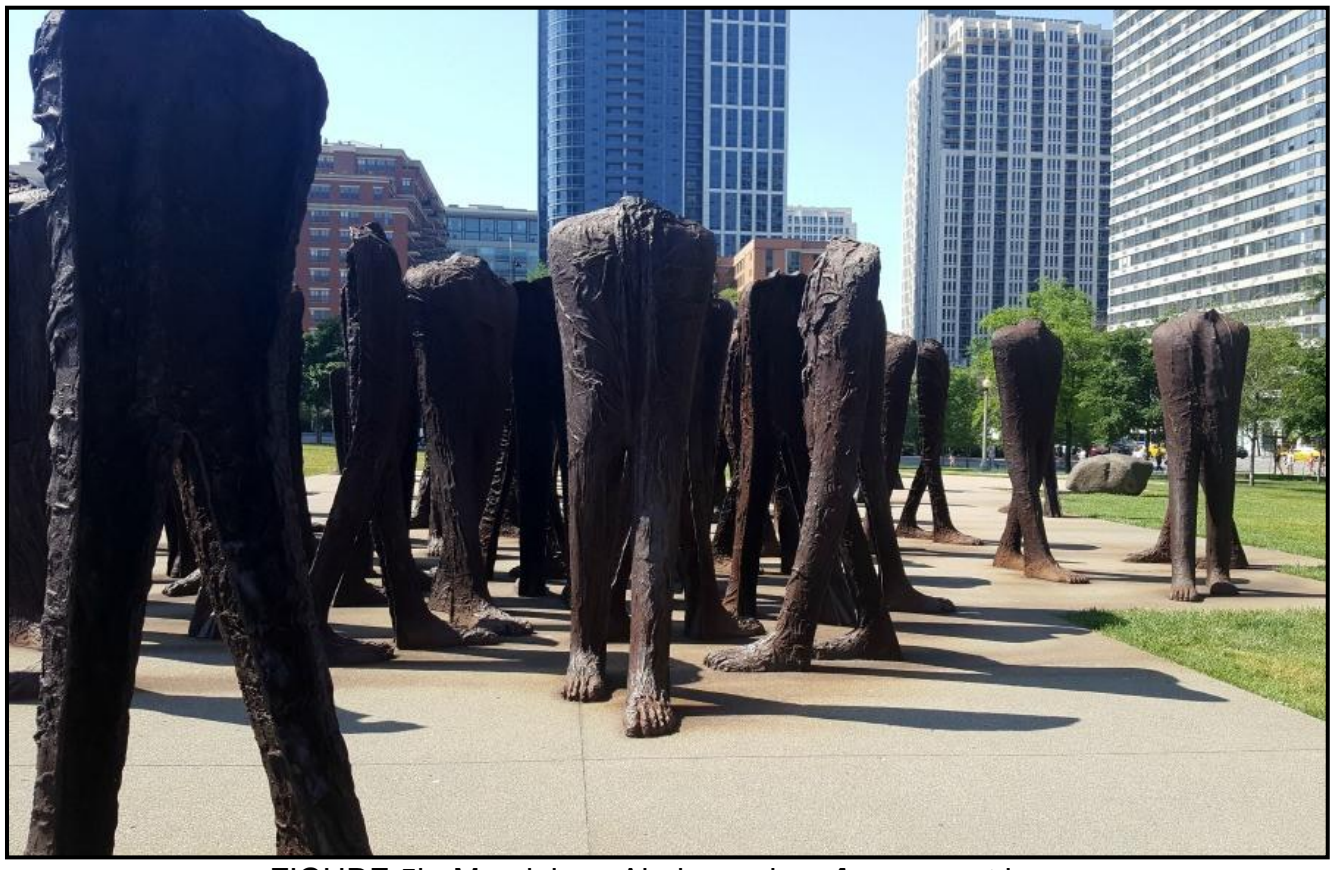
FIGURE 5b: Magdalena Abakanowicz, Agora , cast iron, Grant Park, Chicago, USA, 2016.