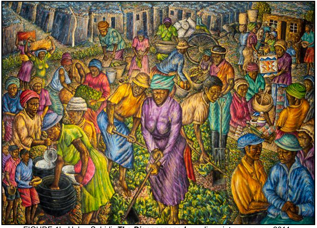
FIGURE 1b: Helen Sebidi, The Dispossessed , acrylic paint on canvas, 2011.