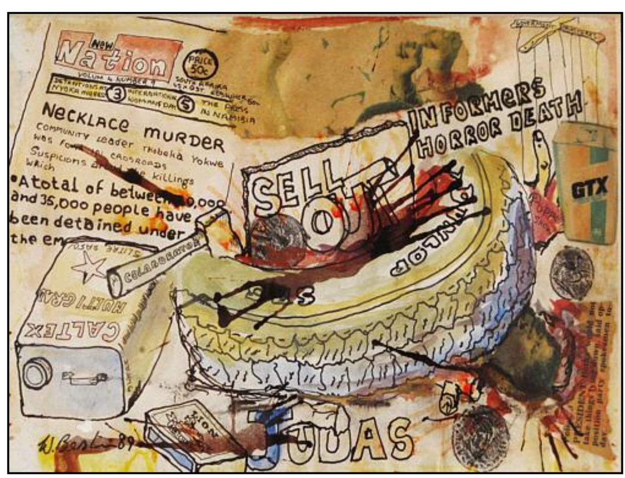
FIGURE 3a: Willie Bester, Necklace Murder , ink wash collage, 1989.