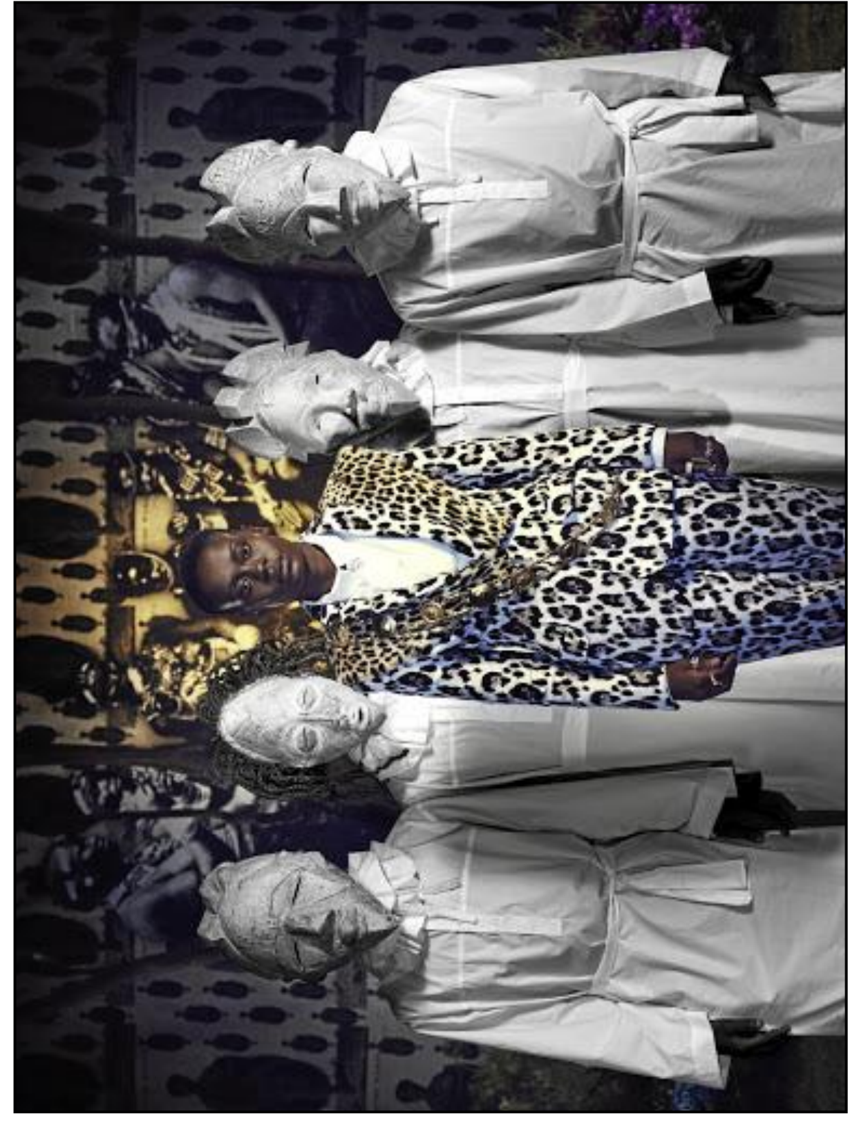
FIGURE 6a: Kudzani Chiurai, We Live in Silence 1, photograph/still of the multimedia performance, 2017.