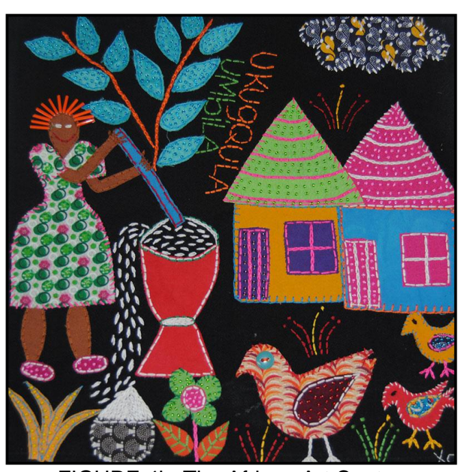
FIGURE 4b: The African Art Centre, Ukugqula Umbila (stamping of mealies/corn) Applique (embroidered panel) by the Ntokozo Group, 2004.