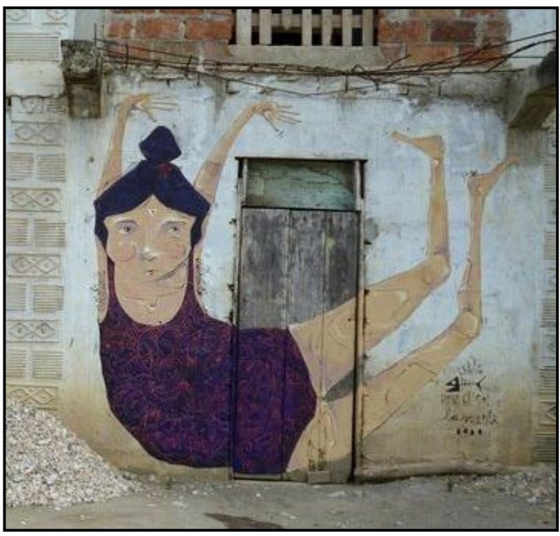
FIGURE 7a: La Suerte, title unknown , mural in a slum area, 2015.