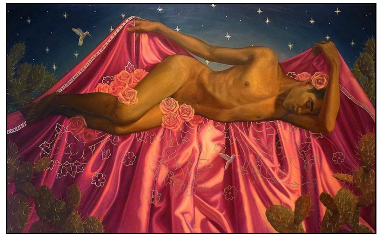
FIGURE 7b: Fabián Chairéz, El Jardin De Las Delicias (from the series The Garden of Delights ), oil on canvas, 2015.