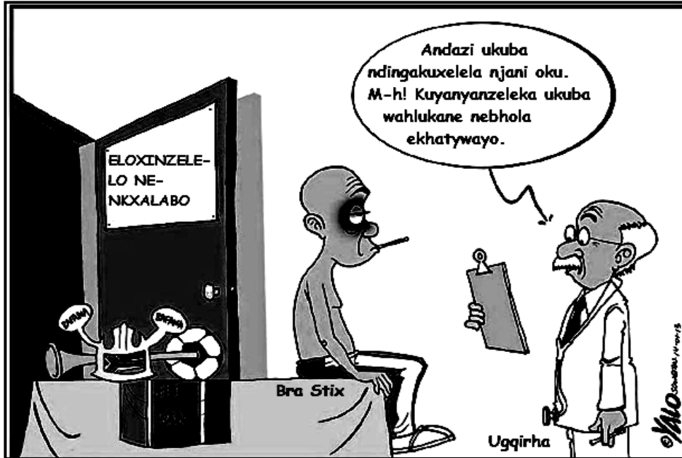
[Uthathwe kwiwebhusayithi yeSOWETAN 14-01-2014 wahlelwa]

5.2.1 Bhala kwakhona isivakalisi esilandelayo sibe kwimo evumayo. Andazi ukuba ndingakuxelela njani oku. (1)