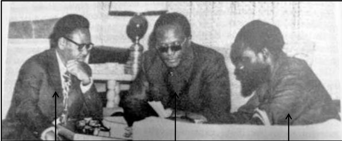
Agostinho Neto (MPLA)

The photograph below shows Agostinho Neto (MPLA), Holden Roberto (FNLA) and Jonas Savimbi (UNITA) in discussion at the Alvor Summit that was held in Portugal. It was published in the News Diary of Lisbon , a Portuguese newspaper on 15 January 1975.