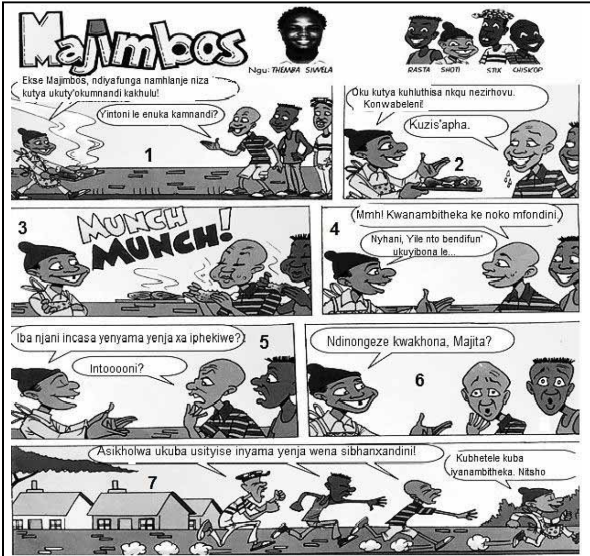
[Icatshulwe kwiBona, Agasti 2006; iphepha 103]

Funda le khathuni uze uphendule imibuzo elandelayo.